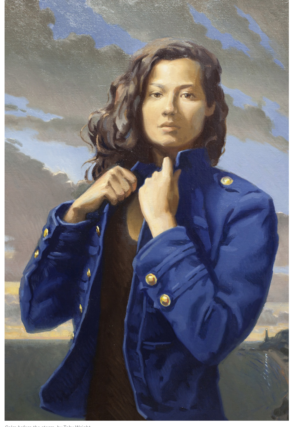
Calm before the storm, by Toby Wright