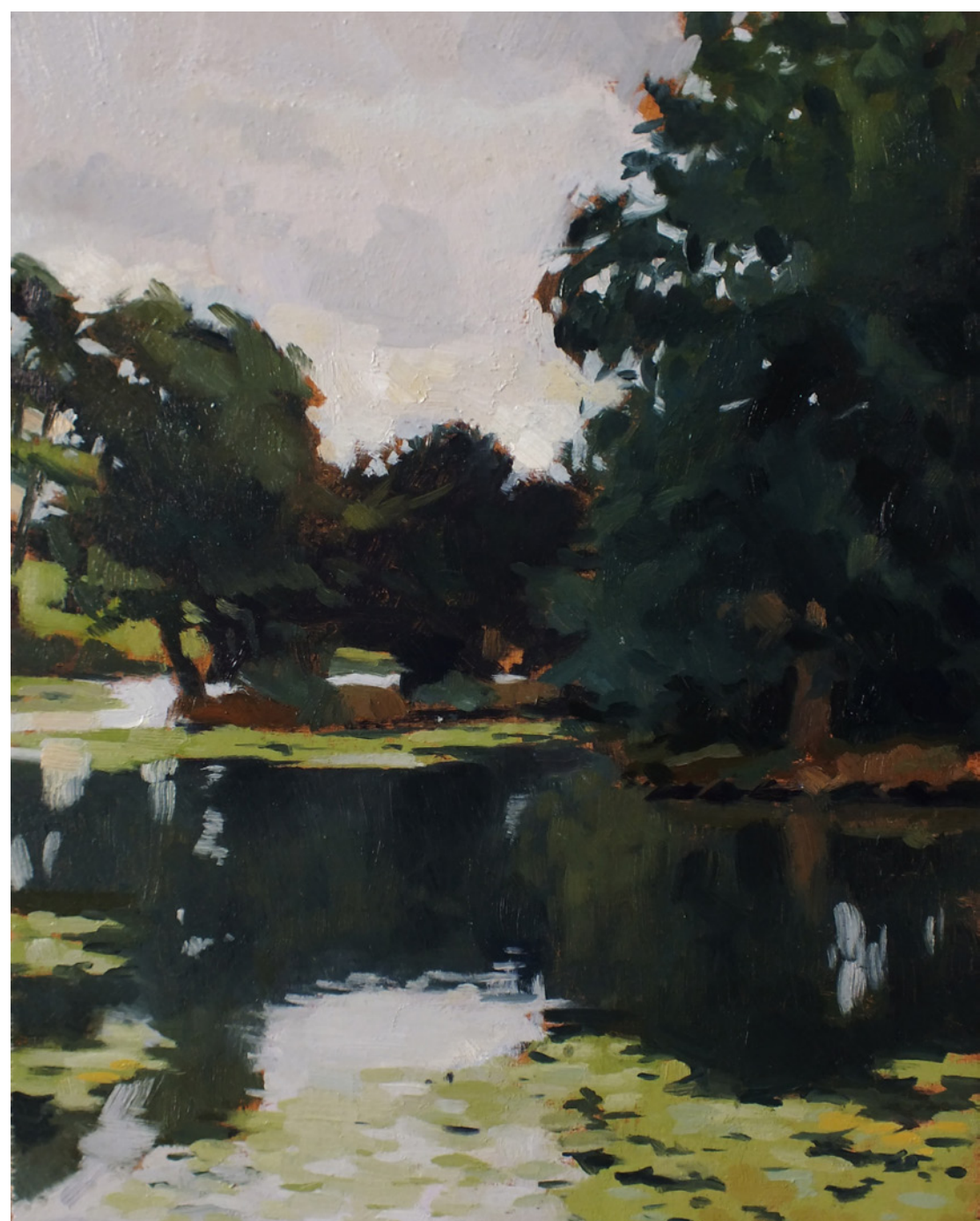
Stowe pond, grey day, by Toby Wright