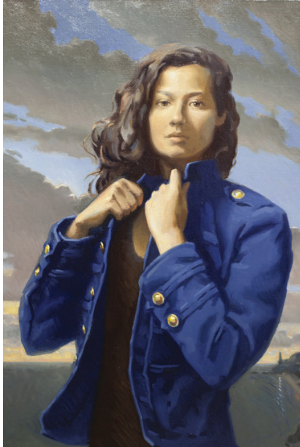
Calm before the storm , by Toby Wright