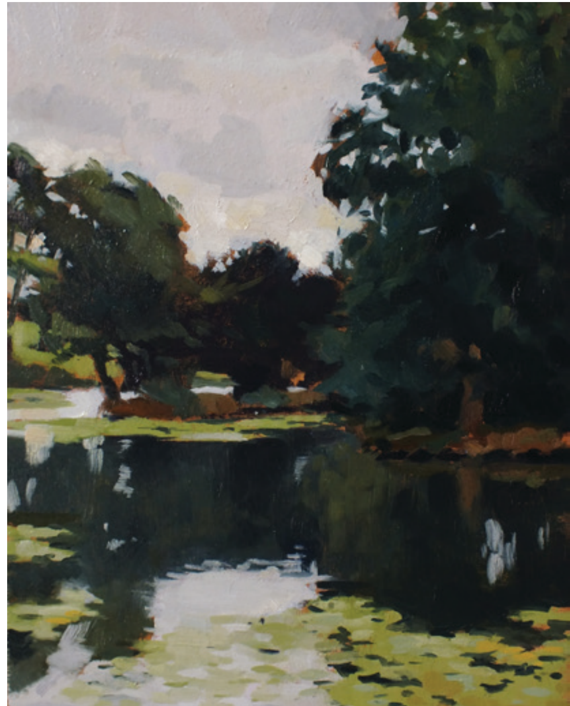
Stowe pond, grey day , by Toby Wright